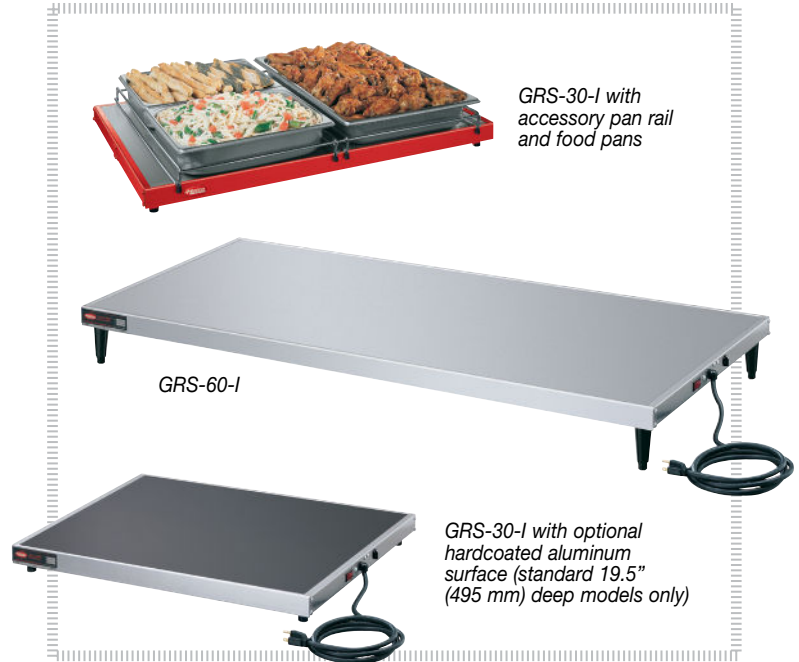
GRS-30-I with accessory pan rail and food pans